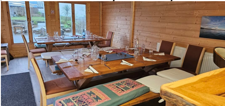
Clubhouse all ready for a Sunday lunch